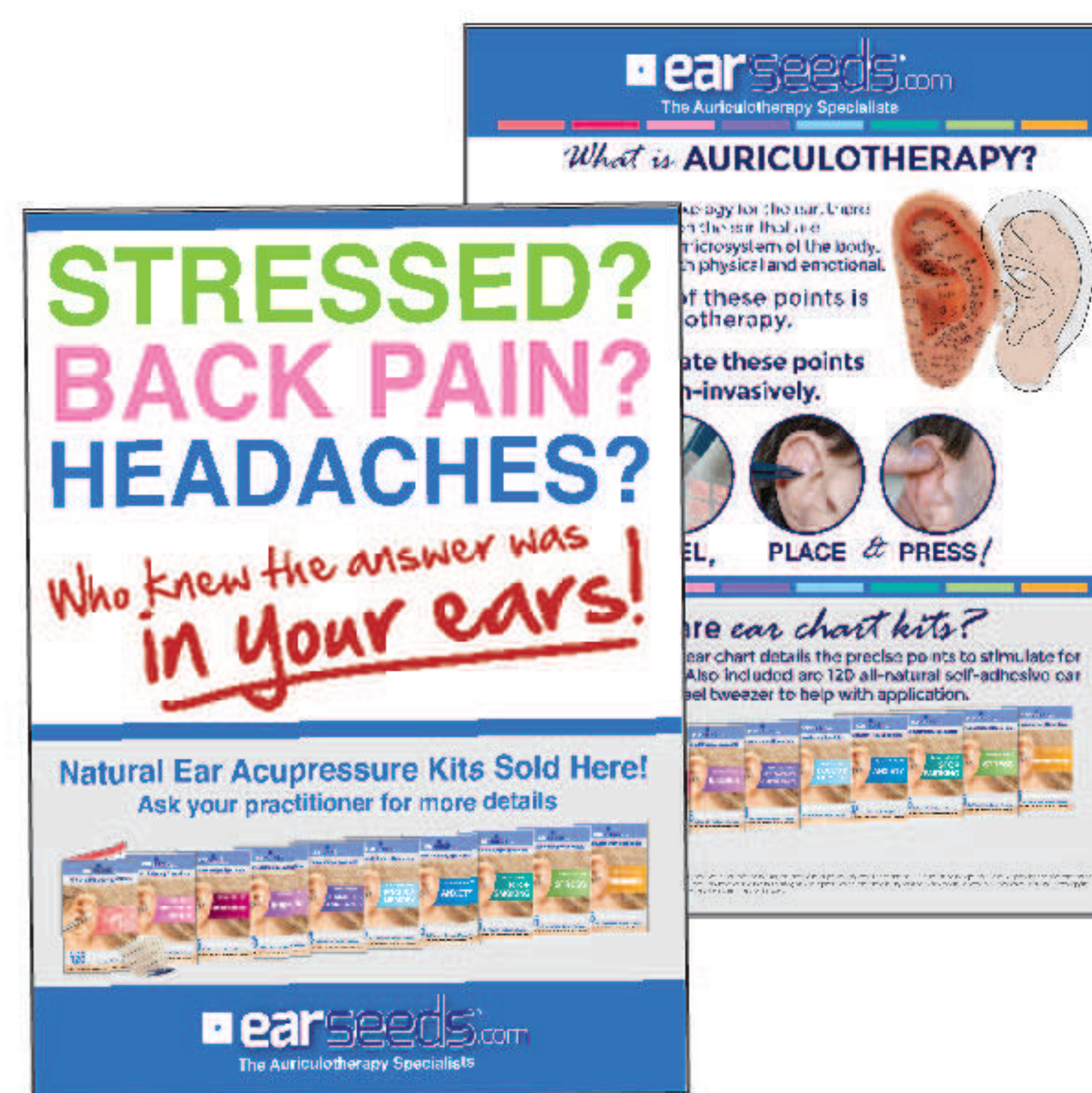
2 EDUCATIONAL OFFICE POSTERS