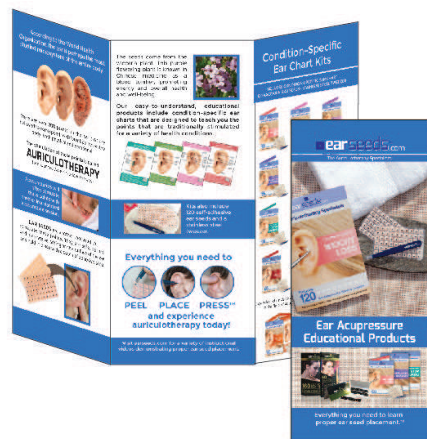
12 AURICULOTHERAPY EDUCATIONAL PAMPHLETS