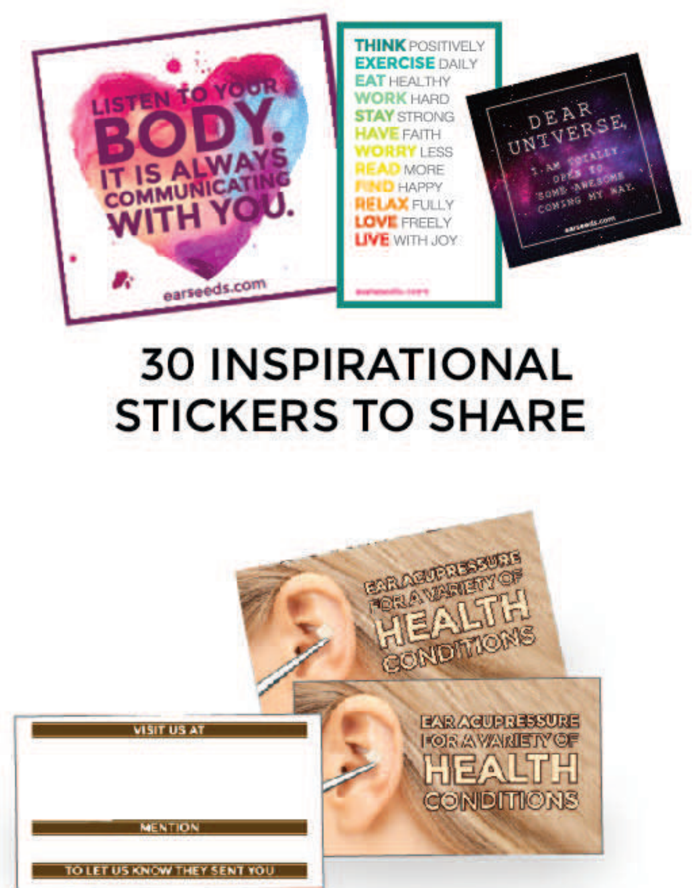
30 INSPIRATIONAL STICKERS TO SHARE

Four week turn-around after final approvals.