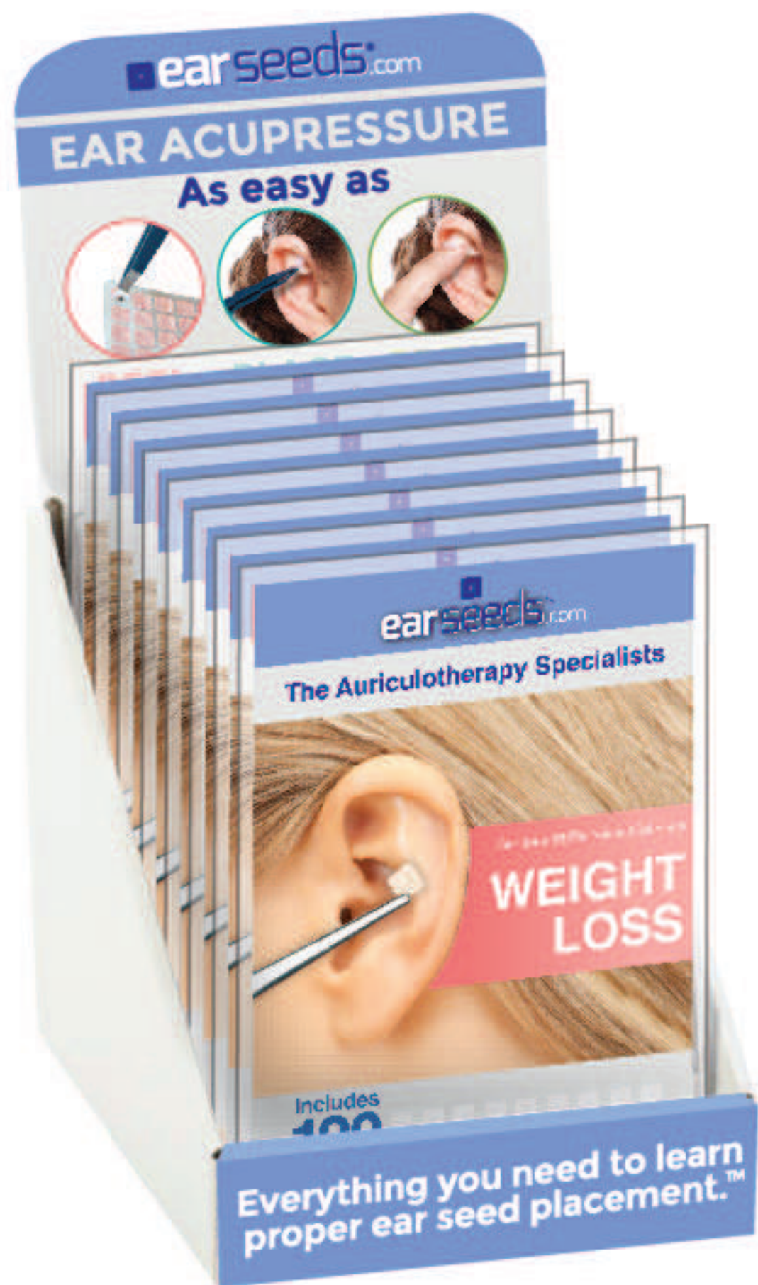
COUNTERTOP DISPLAY HOLDS 12-15 KITS